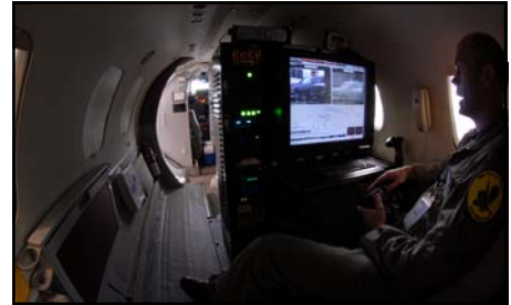
Lt Col Wolff demonstrates the state of the art, FLIR observation station inside the RC-26B. The FLIR can pinpoint targets 7 miles away as opposed to 5 with the old style pod. Using this device, C-26 crews also have a 20% increase in working data, can blend low light and IR images onto one screen for optimum imagery, and they can "freeze" an image for further investigation without disrupting the recording process. All this in HD too! The turret's only short-coming is the loss of 'geo-rectification', which is the ability to over-lay images to make a larger one. But with loss of pod weight, the crews believe they have a keeper.