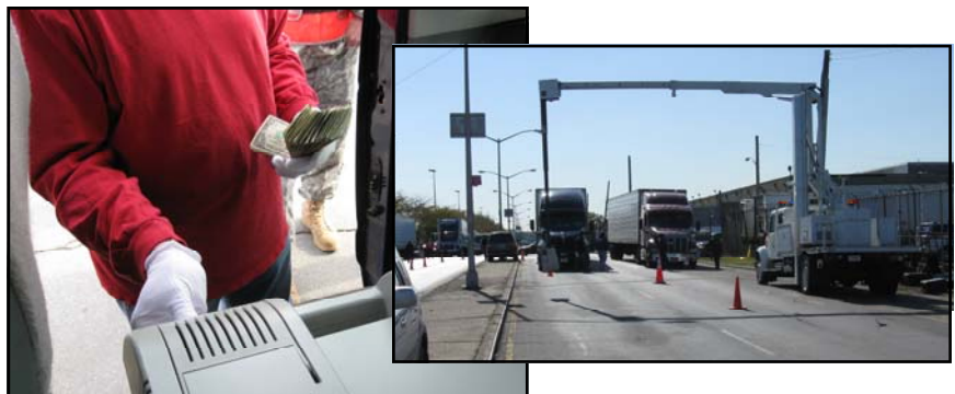
[L] Confiscated cash is checked for drug residue. [R] Eighteen-wheelers are scanned for contraband [Both in the NYC Region]*

The MVACIS inspection system provides substantial flexibility to assist with a variety of security missions including contraband interdiction (i.e. narcotics, weapons, and cash). Mobile scanners use gamma rays as opposed to x-rays, allowing lower equipment cost, smaller operating space, higher reliability, availability, and safer operation. We have to this date supported 13 agencies including: NYSP, DEA, Schenectady PD, Albany PD, Norwich PD, as well as the NYPD.