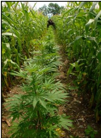
LEA officers "rip up" a row of pot plants in a Washington County corn field spotted by OH-58 pilots. This field alone netted nearly 970 plants!

The FY09 season for the NYNG CDTF Marijuana Eradication Team has been very successful. As of 17 September, the Erad Team had surpassed their number of plants eradicated compared to FY08 by more than 75%! The grand total thus far is 2,769 plants with three more missions planned before FY10. The biggest "bust" was in Washington County while supporting their counter-narcotics task force. Al-