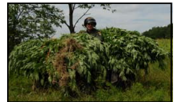
Pot plants being "four-wheeled" out of a corn field by a Washington County LEA agent. Last years net was equaled in this one day of "harvest".

the LEA", said one pilot. "I think we have proven that we can support these missions and hopefully, that will equate to more funding and flight time to have even more success next season.