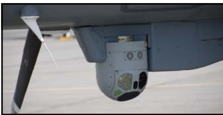
"The 'Katrina Modification' FLIR Turret not only has better optics than the old pod, but it also reduces the C-26's weight thus allowing for more time 'on station'", Lt Col Karl Wolff informs.

also supported AFSOC operations between 1 October, 2008 thru 30 April, 2009 and again between 16 September, 2009 to a few date still yet to be determined.